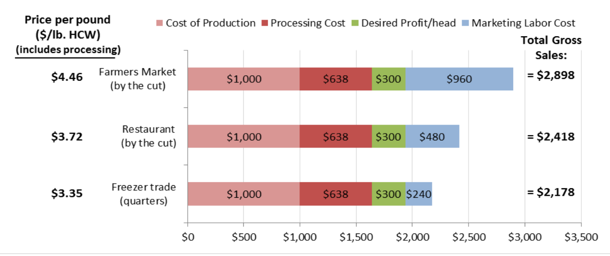
Figure 2: Assuming that the cost of production, processing cost, and profit received is equal in all three channels, the different marketing cost required would necessitate different total gross sales and therefore, channel-specific pricing.

In summary, each farm will select their best marketing channels based on the farm's income goals, the scale of production, and farmer preferences. Once chosen, each channel needs its own pricing to ensure the farm reaches its goals. Read our next article for details on setting prices for each channel.